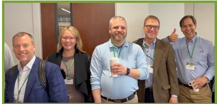
Certifying Exam Case Development